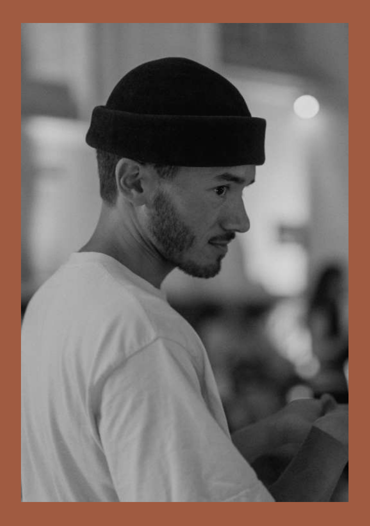
<u>Rogier Houwen</u> photographed Forci's magical natural surroundings accentuated by light and dark and radiating his theme of cosmic awareness.